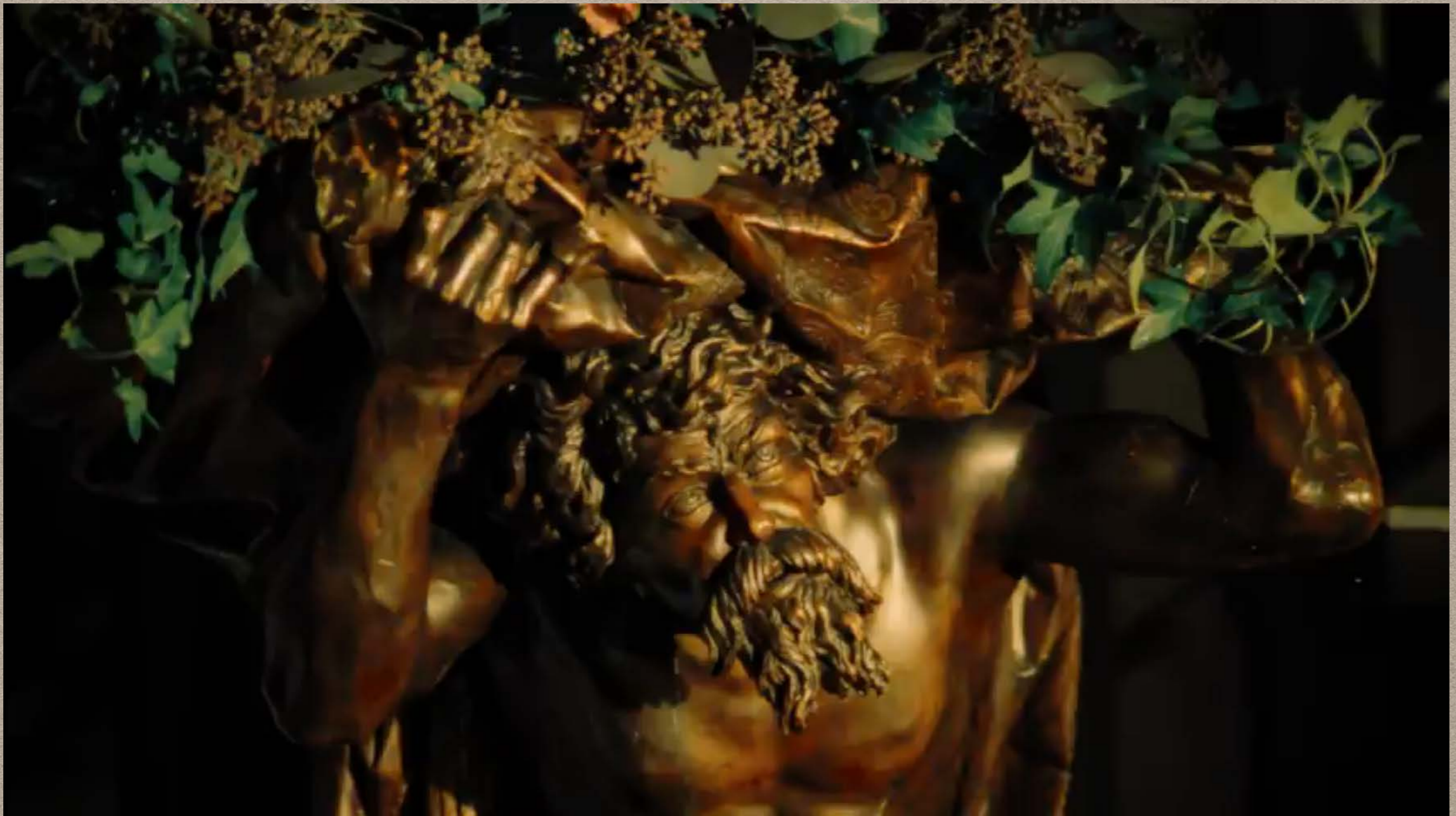
Hurt • Johnny Cash Trent Reznor