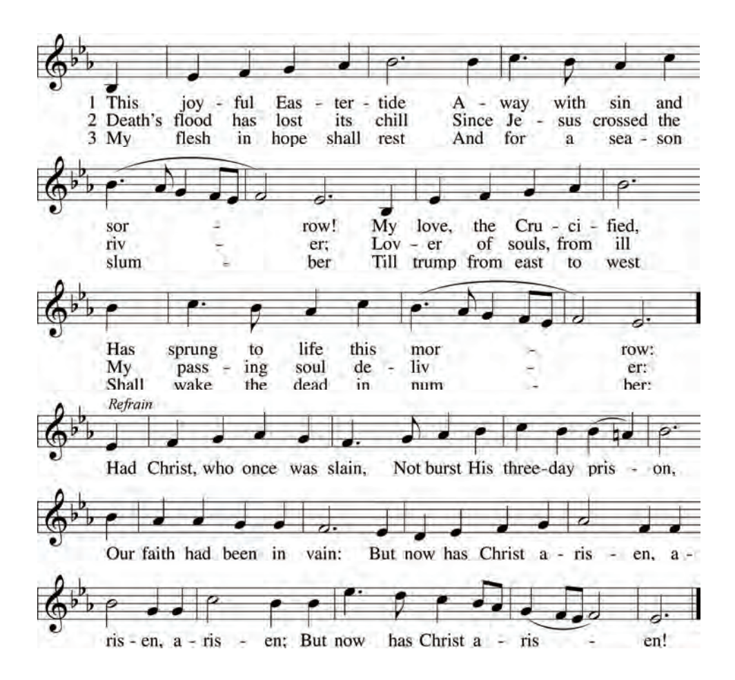
Soli Deo Gloria