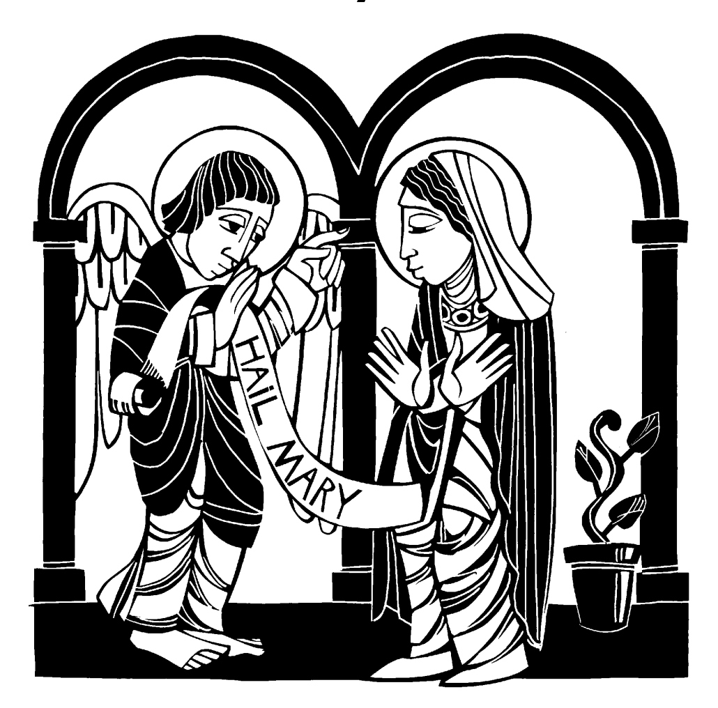
4<sup>th</sup> Week in Advent