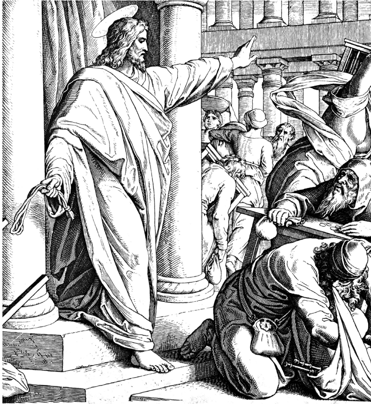
Jesus clears the temple.

This examination of NT texts should begin with the same observation with which my brief survey of OT texts began: when “anger” is the topic, a large number of NT passages refer to God’s anger, either with reference to the Father or (occasionally) the Son. About 38 times, “anger” words in the NT refer to God’s anger; twice Jesus is explicitly said to be angry (Mk